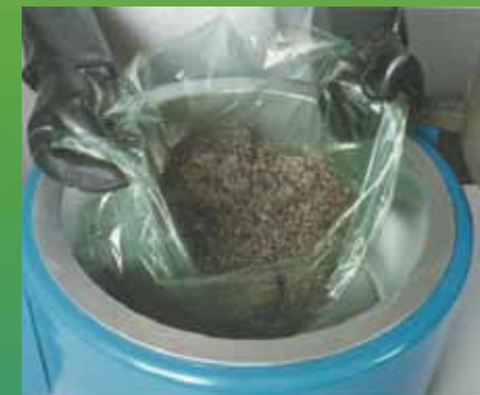
Residue is removed from the boiling chamber at process completion and disposed of according to local regulations.