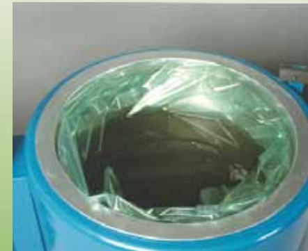
LSJRE boiling chamber filled with solvent.