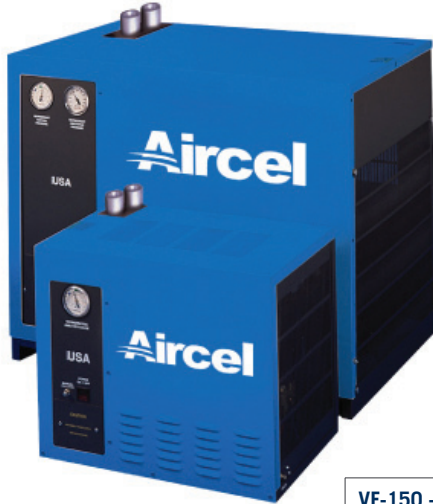
VF-150 - VF-300

The Aircel VF Series (10 - 1,200 scfm) offers the highest efficiencies at varying flow conditions in a lightweight, compact design. No other dryer in the industry can offer the efficiency ratings achieved by the VF Series dryers in variable flow operation. VF Series dryers are built with the patented Variable Flow heat exchanger, which allows for desired dew point performance regardless of flow variations. Typically, other dryers with mechanical moisture separators lose performance as compressed airflow velocity increases or decreases substantially around the nominal design point.